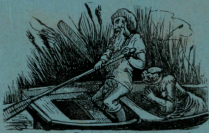
ON THE RIVER.—Those bothering bulrushes. Ma trusts to Pa.