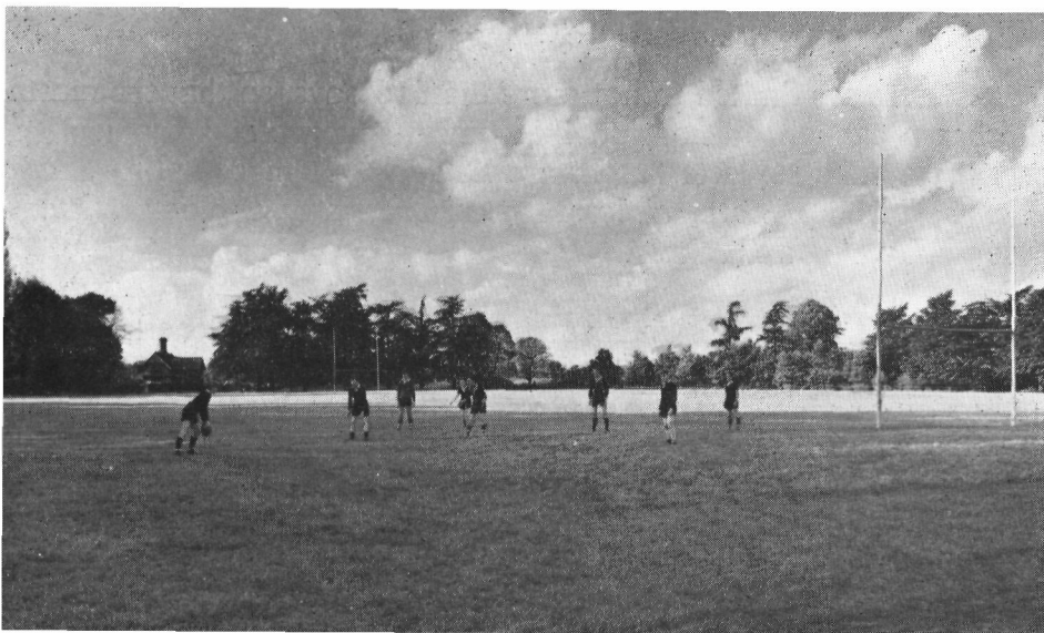
PART OF THE PLAYING FIELDS