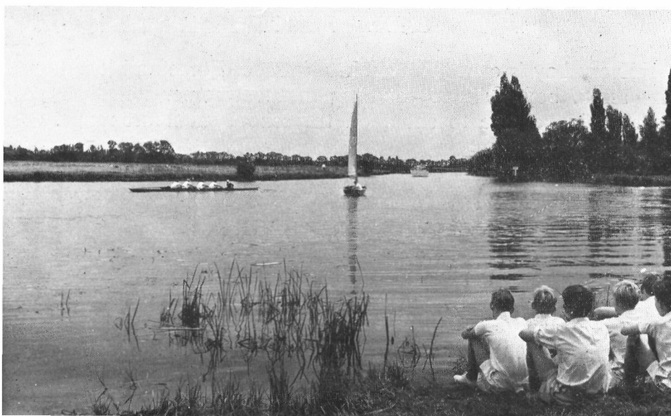
ROWING AND SAILING ON THE THAMES. LYNCH ISLAND ON THE RIGHT