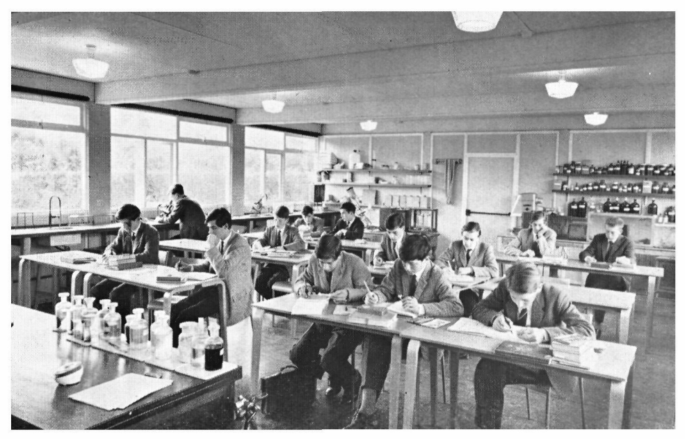
THE BIOLOGY LABORATORY