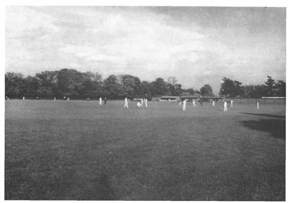
PART OF THE PLAYING FIELDS