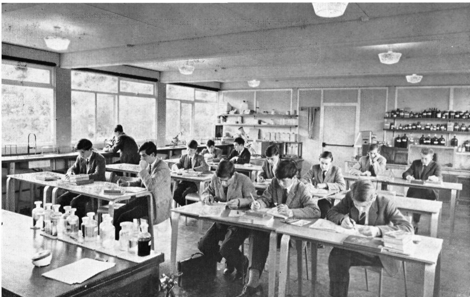
THE BIOLOGY LABORATORY