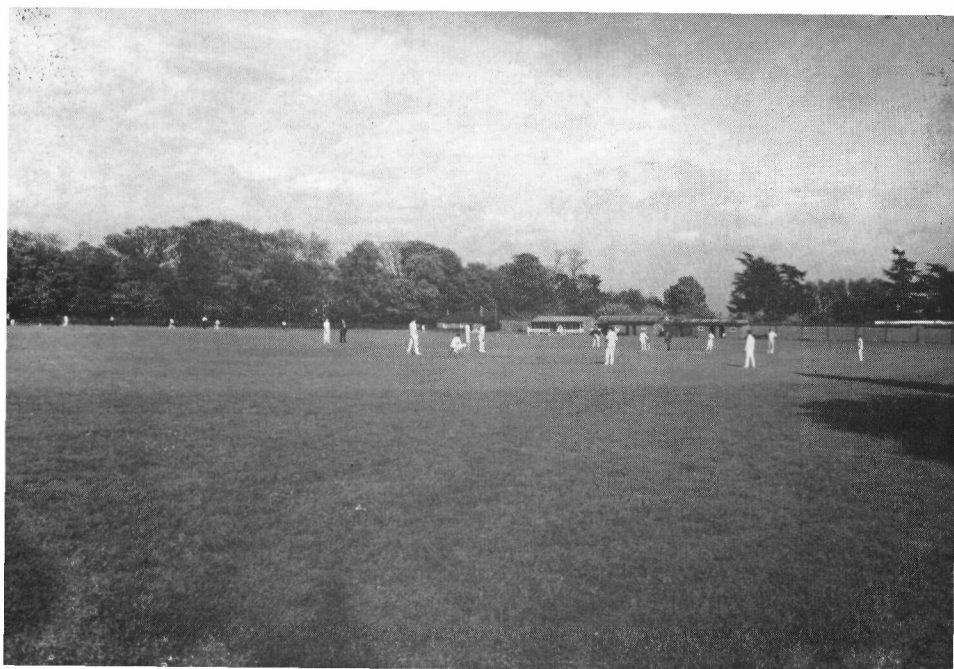
PART OF THE PLAYING FIELDS